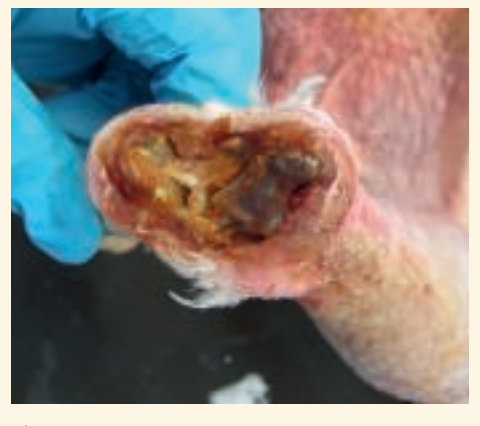
Photo 3. Opened heel joint. Old joint amyloidosis detected on the slaughter line. The bacteria responsible can often no longer be isolated in such old injuries. (Source: GD)

Photo 2. Opened knee joint. The strong orange discolouration of the joint capsule is a sign of joint amyloidosis. (Source: GD)