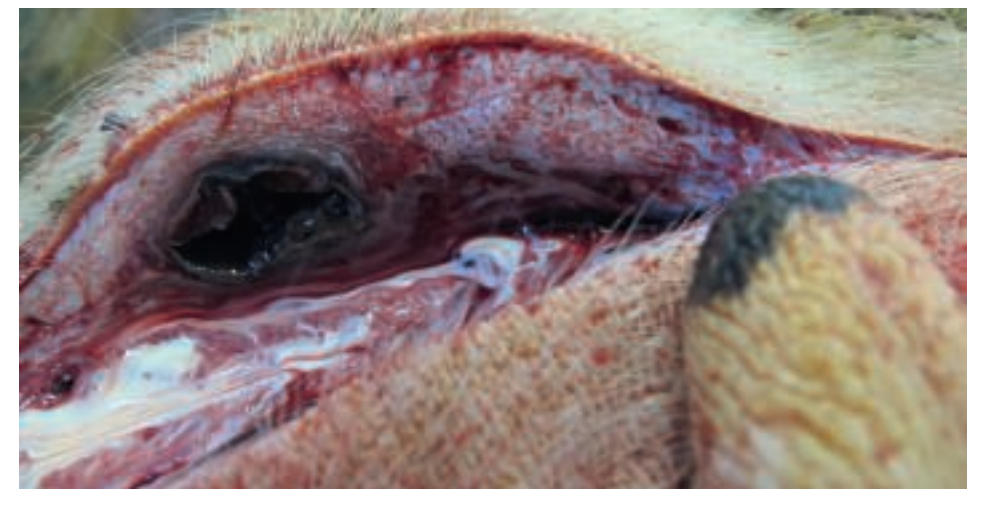
Figure 1. Udder skin with affected branch of the mammary vein

complications, these blood vessels are involved in the inflammation process, resulting in thrombophlebitis. Blood clots containing bacteria (emboli) travel via the mammary vein and the heart to the lung, where they cause metastasized pneumonia. This pneumonia is a complication of the udder skin inflammation. The cows became feverish, suffered respiratory problems, produced less milk and died, despite treatment with antibiotics. In nine of the ten cases, the UCD had not been clinically detected. Furthermore, we also conducted necropsies on ten dairy cattle with uncomplicated UCD this year. In these cases,